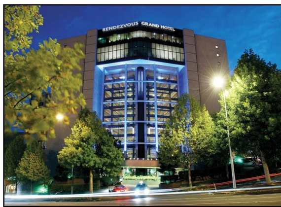
Rendezvous Hotel: Venue for the 2015 conference in Auckland

Moral Reconciliation Therapy (MRT™) will be reviewed so that attendees gain an understanding of the program's theoretical base. Attendees will be presented with the most recent outcome data. Information will be presented in relation to implementation and outcomes from the use of MRT™ as a primary treatment modality and its inclusion in the US Substance Abuse and Mental Health Services Administration (SAMHSA) National Registry of Evidence-based Programs and Practices.